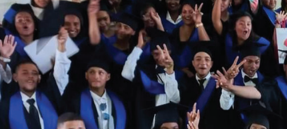
Learners were excited to show their commitment to shining a light on after school programmes